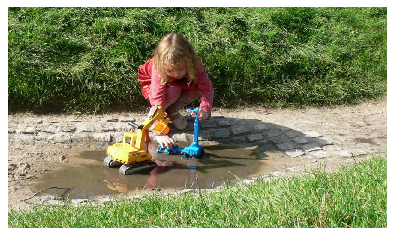
Examples of a deliberately playful paths and routes

We are interested in making use of the old paths if these are identified. For movement in and through the park we need spaces where it is comfortable to turn and pass if using a wheelchair, or if a parent is pushing a buggy or double buggy. We expect that such spaces can be attractive and may have playful features. Path surfaces should link visually to the paved surface of The Usual Place.